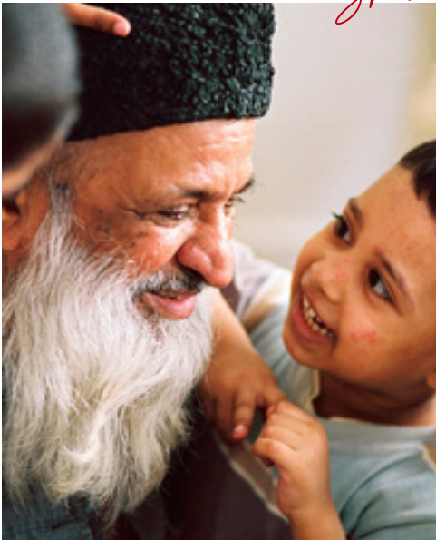
HUMANITARIAN LEGENDARY SOCIAL WORKER PERSON WITH EPILEPSY Ambassador, National Epilepsy Centre, Pakistan

"Empty words and long praises do not impress God. Show Him your faith by your deeds."